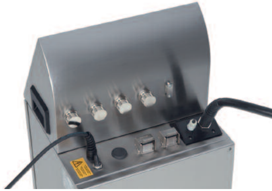
Multiple connections on the reverse

alphaJET into prints economically in high quality, at fast production speeds, with low maintenance and it is easy to operate.